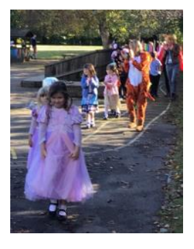
This is just a flavour of the exciting time the children had celebrating books and stories.