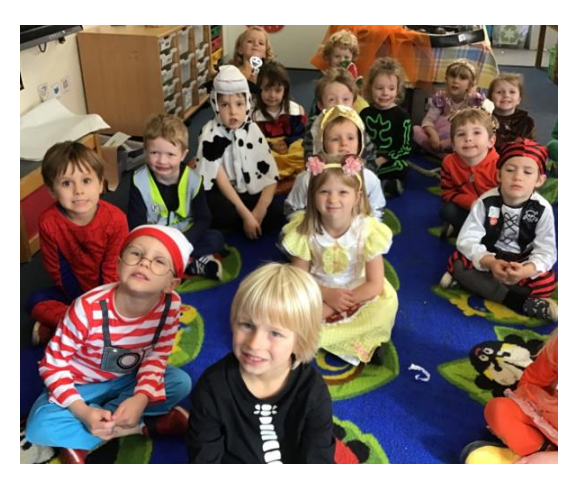
And everybody joined in the Busbridge Infant School Book Character Parade!